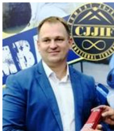
VLADYSLAV SHYPINSKYI PRESIDENT CJIIF / UWC – Combat Ju-Jutsu International Federation / United World Combat 8 th Black belt CJI